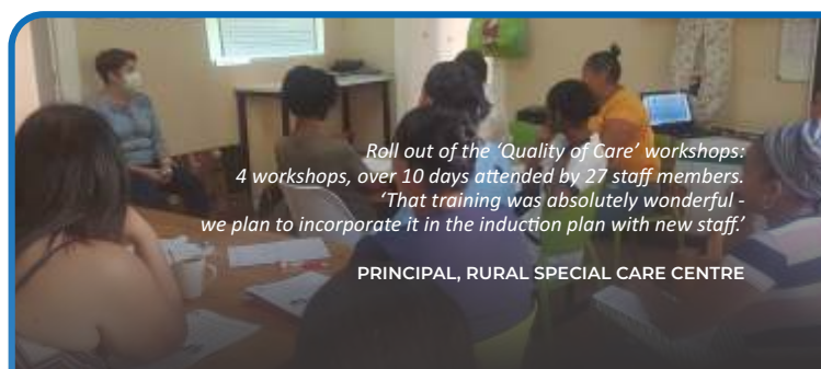
Roll out of the 'Quality of Care' workshops: 4 workshops, over 10 days attended by 27 staff members. That training was absolutely wonderful - we plan to incorporate it in the induction plan with new staff.'

"I would just like to say thank you for always being helpful when I have a question regarding training, etc. You guys rock!" SOCIAL WORKER, RURAL DISABILITY ASSOCIATION