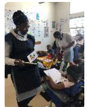
Special Care Centre, Khayelitsha - chance observation of the implementation of the communication tool