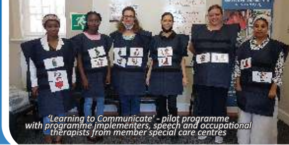
'Learning to Communicate' - pilot programme with programme implementers, speech and occupational therapists from member special care centres

Resource development (manuals, pamphlets, and visual materials) in response to needs is a core programme of the WCFID. With the ongoing pandemic, the year under review focused on making training material more accessible through developing online courses and webinars, and converting face-to-face training into online material to be distributed as training packages. In this way, the reach was expanded beyond the WCFID's office space to the rest of the Western Cape, South Africa, and beyond.