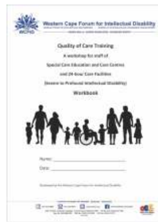
Quality of Care Workbook Cover Page