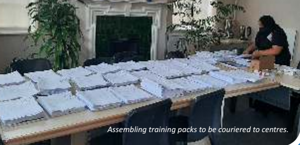
Assembling training packs to be couriered to centres.