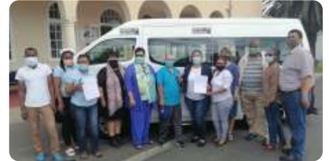
WC MEC of Social Development, WCFID director and staff of the two special care centres with one of the 2 buses at the WCFID offices